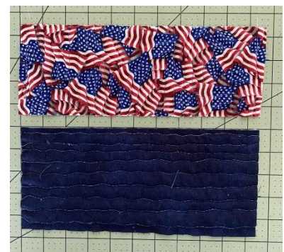
Two fabrics – “straight” bottom