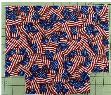
Single fabric – “Boxed” bottom